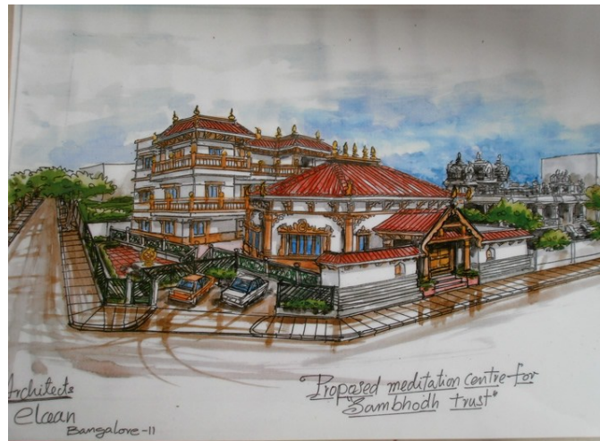
SAMBODH CENTRE & TEMPLE — FULL PLAN

Sambodh Foundation enjoys tax exemption under 80 G.